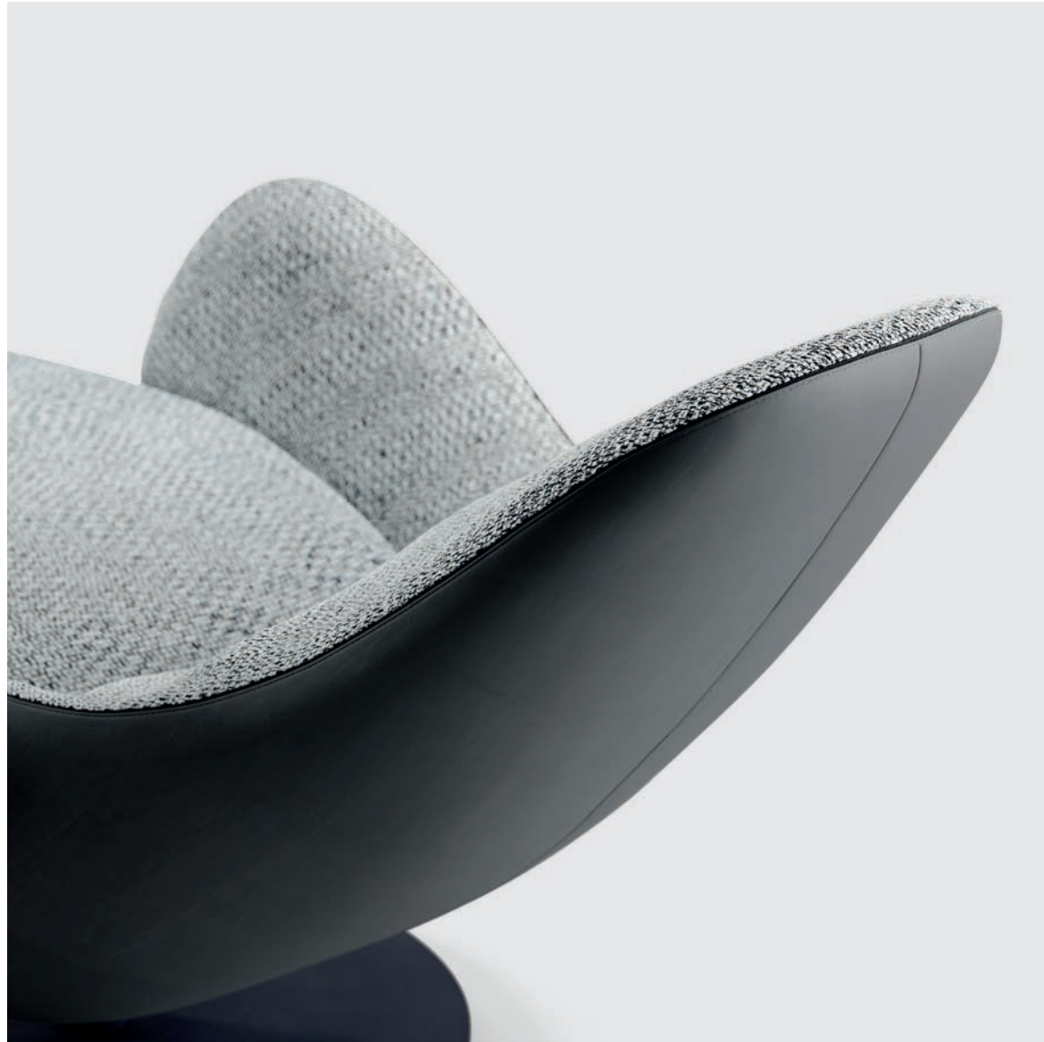
lazy louise, your ally on weekends