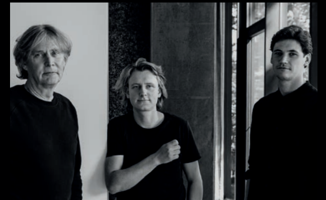
design studio segers

truly take control of our high end quality. Right here at home we smell the sent of natural fabrics, leathers, woods and stone, we feel the artisan vibes. No matter how far our Snooze travels to its new home, we will always cherish our local craftsmanship. This is how we do things. This is our tradition.